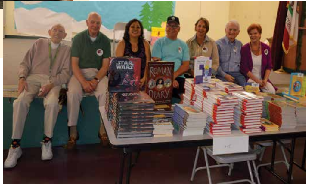
Great American Book Giveaway: Cahuilla Elementary students each received three new, age-appropriate books from members of the Palm Springs Noon Rotary Club at the group's Great American Book Giveaway just before the holidays. The club, who adopted Cahuilla several years ago, donates books to Cahuilla students each year for them to keep or share with siblings.