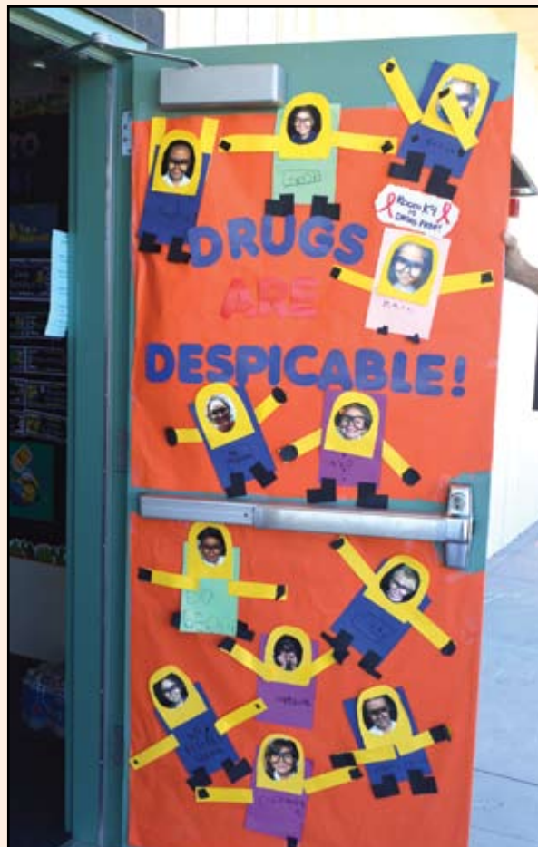
Doors Spread Red Ribbon Week Messages: Rio Vista Elementary commemorated Red Ribbon Week with a door decorating contest to spread the "Say No to Drugs" message. First place honors went to Melissa Ferguson's kindergarten class for their "Drugs are Despicable!" creation.